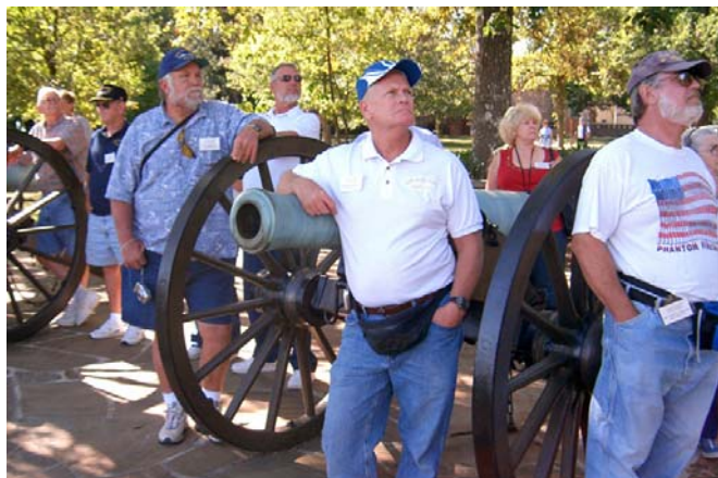
Point Park, 2007