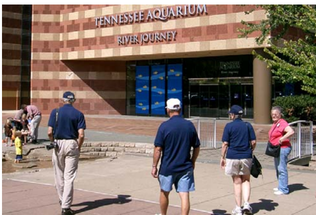
Heading to the Chattanooga Aquarium