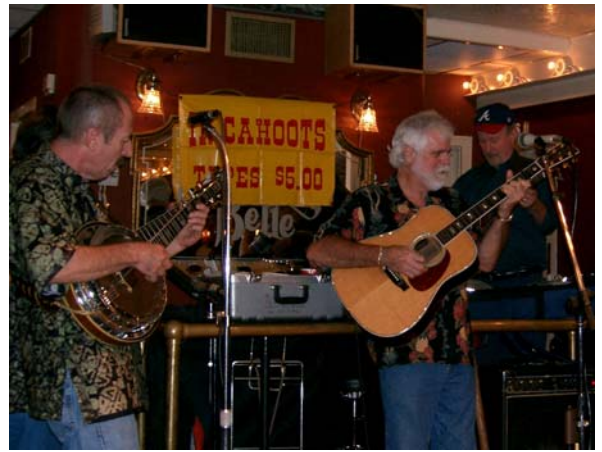
Entertainment provided by the band "In Cahoots"