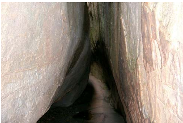
"Fat Man's Squeeze", but even I had trouble getting through!