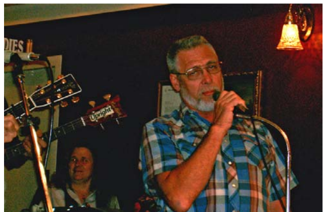
"Moose" continues to amaze us with his talents!

Quad Cities Visitor's and Convention Bureau 102 S Harrison Street, Suite 203 Davenport IA 52801